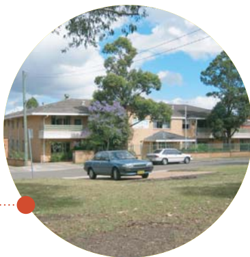
Berala Nursing Home

General planning advice and the preparation of a SEE as part of a DA for the provision of additional low-care bedroom units for Berala Nursing Home to comply with the 2008 Federal Guidelines. The proposal involved an extension into two adjoining residential properties. Particular issues addressed in the application related to urban design, drainage, construction and staging impacts and accommodation for existing residents during the construction period.