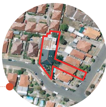
Jenny Lyn Nursing Home

General planning advice and the preparation of a SEE as part of a DA for alterations and additions to the Jenny Lyn Nursing Home. The proposed works included the provision of additional low-care beds and basement parking on an adjoining property.